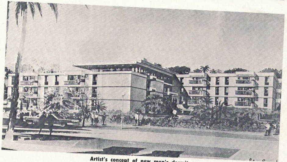
Artist's concept of new men's dormitory.